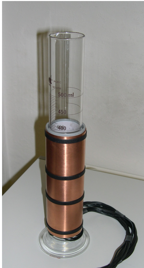
Figure 1. PTL LS100 ECT sensor