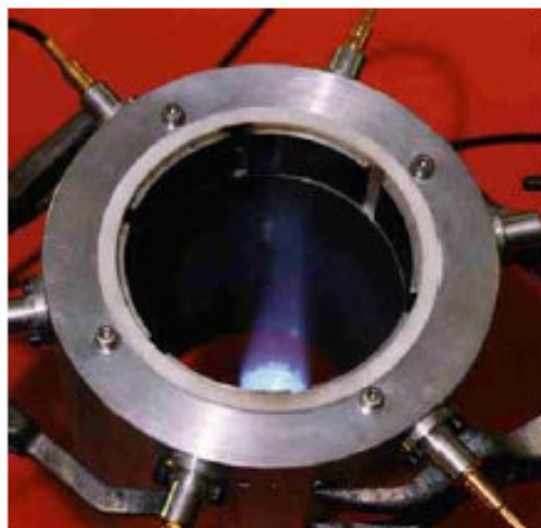
ECT flame and combustion sensor