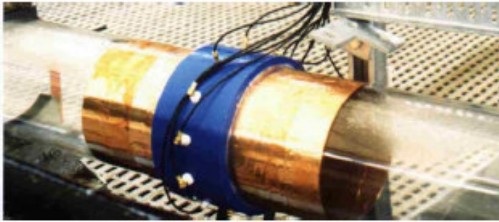
ECT sensor for monitoring oil/gas flows