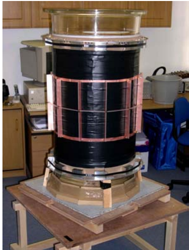
450mm diameter twin-plane sensor showing internal radial screening