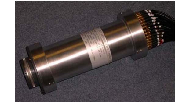
Sliding sensor showing friction clamps and connecting leads